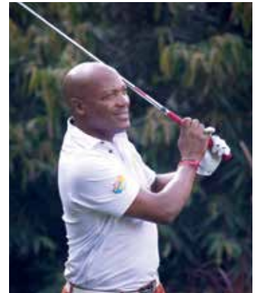
Mr Brian Lara