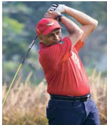
Admiral Sunil Lanba , Chief of Naval Staff Indian Navy, Delhi