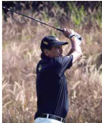
Mr Kapil Dev