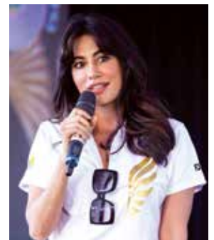
Ms Chitrangada Singh