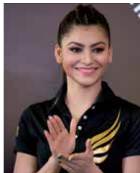
Ms Urvashi Rautela