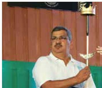
Mr Abhay Jyotishi , Chief Commissioner of Customs, Govt. of India, Bengaluru